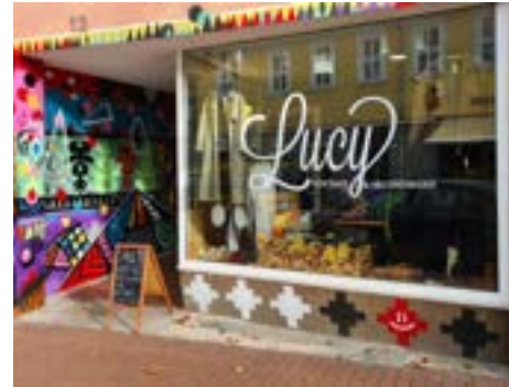
Lucys Vintage and 2nd Hand (vintage clothes, more expensive)