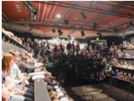
Theater im OP (free with Kulturticket)