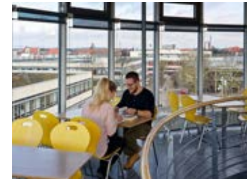
Café SUB (nice view, practical)