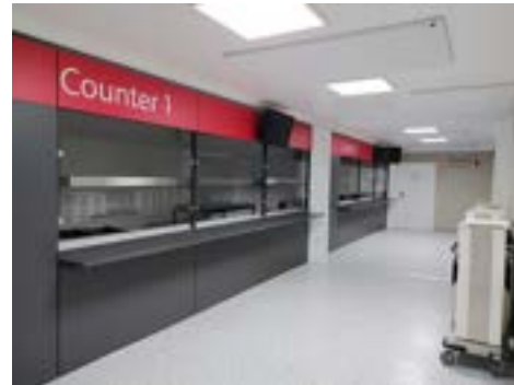
Lunchbox (only two options, only take away)