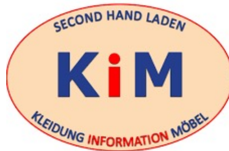
KiM Second-hand Shop (clothes, dishes, etc.)