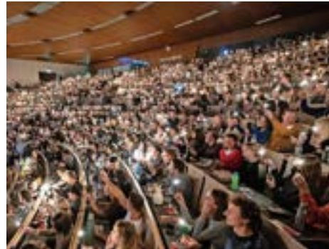
Unikino (fun atmosphere, don't miss their Christmas event)