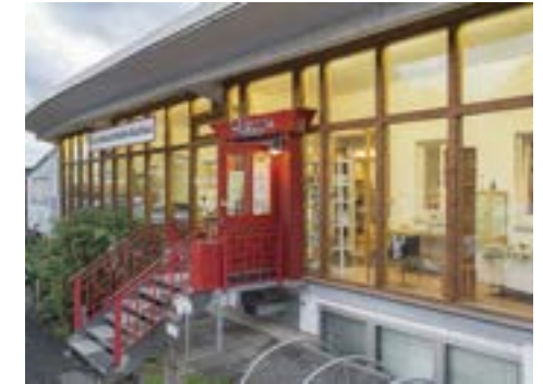
Brockensammlung (furniture: beds, closets, tables, desks, dishes, clothes, books, etc.)