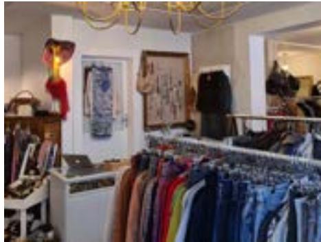
Klamotte Second Hand (clothes, small household items, etc.)