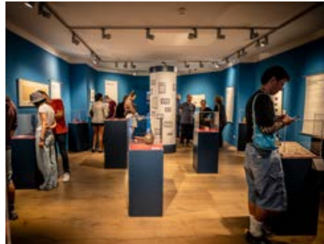
Städtisches Museum Göttingen