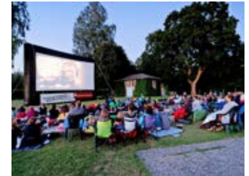
Openair Kino (Freibad Brauweg, in summer)