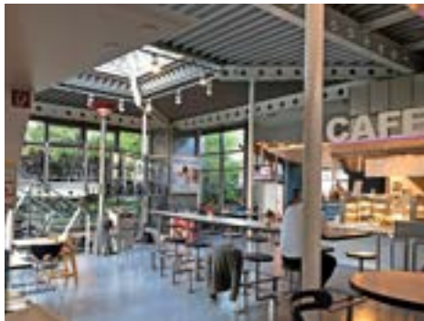
Mensa am Turm (only vegan and vegetarian options)