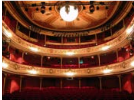
Deutsches Theater (normally free with Kulturticket)