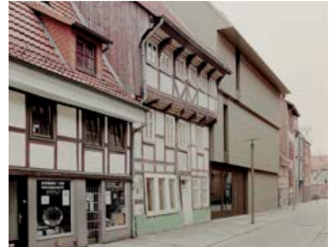
Kunsthaus Göttingen (probably closing soon)