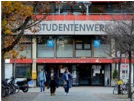
Zentralmensa (biggest variety)