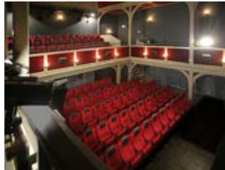
Lumière and Méliès (alternative movies)