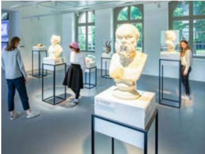
Forum Wissen (informative and interactive permanent and temporary exhibitions)